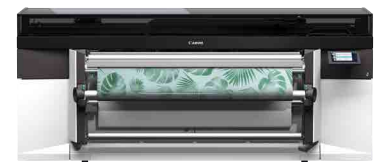
Colorado series printers

Interior décor applications on the Colorado series printers