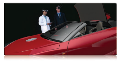
Transition designs right from applications like Siemens NX and RTT DeltaGen into the mixed reality world with the exact same specs, scale, spaces, and precision you designed.

The Canon MREAL System for Mixed Reality seamlessly combines the virtual world of computer-generated imagery (CGI) with your real-world environment. This better enables your development teams to shepherd product ideas from concept to reality in less time. MREAL technology can help you quickly confirm design assumptions, incorporate required characteristics faster, identify potential design concerns, reduce prototype iterations, and get products to market sooner.