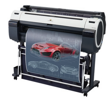
Help expedite your approvals process by showcasing your CAD designs with large, crisp prints.

Office documents with conventional page sizes are suitable for everyday business communication. But a manufacturing operation may require access to larger documents in order to effectively communicate ideas in product concepts, storyboards, CAD drawings, plant layouts, production line changes, facility improvement plans, and more. Canon offers innovative, large-format printing solutions designed to deliver exceptional speed, flexibility, and quality.