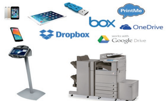
The M500 provides the easiest ways for students to access, pay and print from mobile devices and cloud accounts.

Students need a quick and secure method to print anything from PDFs to Word documents directly from their mobile devices. At the same time, campus administrators need a solution that's easy to manage and configure. With the M500/M505 Self-Serve Copy and Print Station, students can easily access, pay (with debit, credit, or student cash card) and print images and PowerPoint presentations from computer labs or USB drives, mobile devices, and cloud accounts (such as Dropbox, GoogleDrive, and EFI PrintMe).* And with the M500/M505, administrators can also easily add and configure devices and print services, set or adjust price rates, and integrate with campus card payment systems.