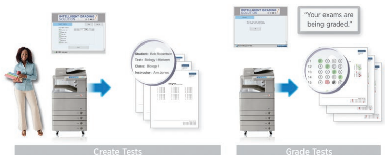
Create Tests Large, intuitive interface makes it easy for teachers to create and grade exams. Simple-to-follow steps help make it easy to learn.

Designed to be easy to use and simple to administer, IGS removes the need for schools to manage servers onsite or provide ongoing maintenance. With this embedded, easy-to-maintain, cloud-based solution, educators can quickly gain insight into class and exam performance using existing MFPs. This helps increase the time necessary to focus on student achievement.