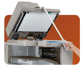
ADF Access Handle enables seated users to operate the device.