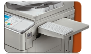
Keyboard can improve access for seated users.