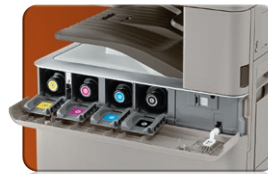
Easy to access toner ink can be changed with one hand.