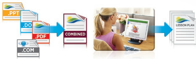
Combine both existing (i.e.; hard copy) and new content (i.e.; Web) into a single reading packet or assignment. Then just drag and drop it to e-mail to your entire class.

Educators are continually challenged to keep their students engaged and captivated. With imageRUNNER ADVANCE Desktop software, teachers can quickly collect and assemble a variety of course materials, leaving more time to concentrate on teaching. With Canon solutions, educators can easily put together compelling course documents and create a single lesson packet. Canon solutions help reduce the time it takes to create course materials and provide engaging and effective lessons.