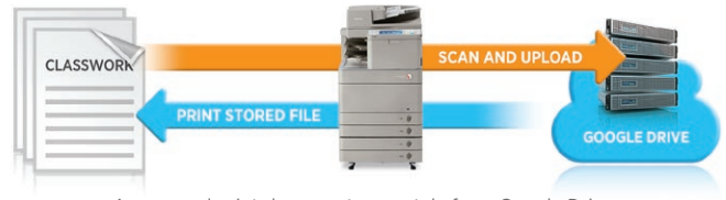
Access and print documents remotely from Google Drive.

Adoption of Google Apps for education continues to increase. Educators now use Google Drive continuously to store lesson plans and course documents, and Canon has multiple ways to use the imageRUNNER ADVANCE system to interact with Google Drive. For example, hard-copy documents can be scanned into and printed from Google Drive. Likewise, from the touch-screen of the MFP, teachers and faculty can retrieve saved course documents directly from their Google Drive folder using uniFLOW. In addition, uniFLOW allows users, through their Google accounts, to store their documents in the cloud on Google's servers and print to Web-connected printers from any Web-enabled device, from phones to tablets to Chromebooks to PCs.