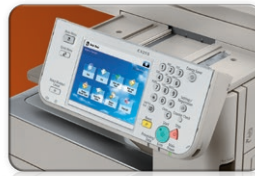
Control panel can flexibly tilt to be visible from any angle.

For students, faculty, and staff with limited mobility, Canon products feature ADF Access Handles and separate keyboards to allow for a more efficient and productive school or campus. A variety of imageRUNNER ADVANCE models also offer flexible control panels, as well as single-button drawer openers and toner doors that open automatically during the replacement process.