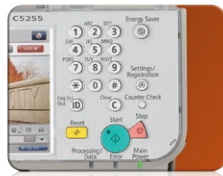
Tactile controls increase functionality.