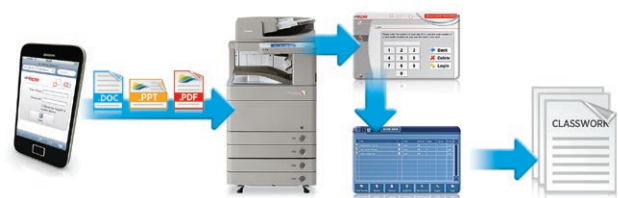
Send documents from your mobile device using the uniFLOW Mobile app.