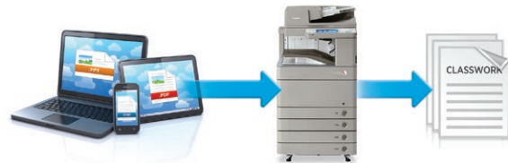
With the Canon Mobile Print app and EFI PrintMe, educators can print documents from their mobile device by using a simple print request workflow.

Users can establish a link between an imageRUNNER ADVANCE system and their smartphones or tablets by scanning a QR code from the control panel display.