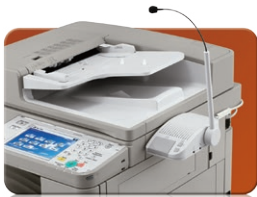
Voice Operation Kit helps to simplify input of commands.