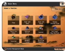
LCD control panels can "reverse" to increase visibility.