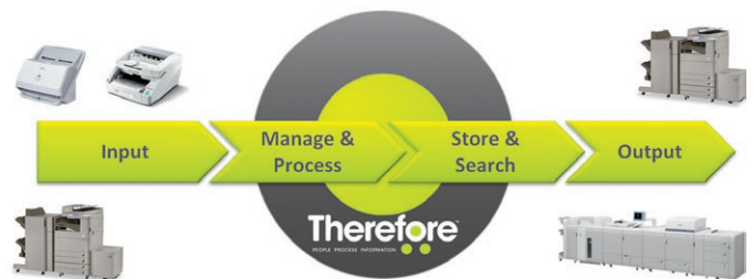
With Therefore, faculty and staff have the ability to capture, archive, retrieve, edit, and process documents quickly, efficiently, and securely.

The education industry remains document intensive with very manual and inefficient processes. Administrators need to provide a more productive and collaborative document management solution for hard-copy student files, registration documents, attendance forms, and more. With Therefore™, a document management system, faculty and staff are able to more effectively do their job by easily capturing, archiving, retrieving, editing, and processing documents efficiently and securely.