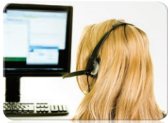
Remote Operator Software enables device control from a networked PC.

For the visually impaired, many Canon products offer specially designed features such as voice guidance and operation, concave keys, and reversible displays. In addition, large, bright control panels, Braille label kits, and screen reading software ensure that the visually impaired can easily use Canon devices.