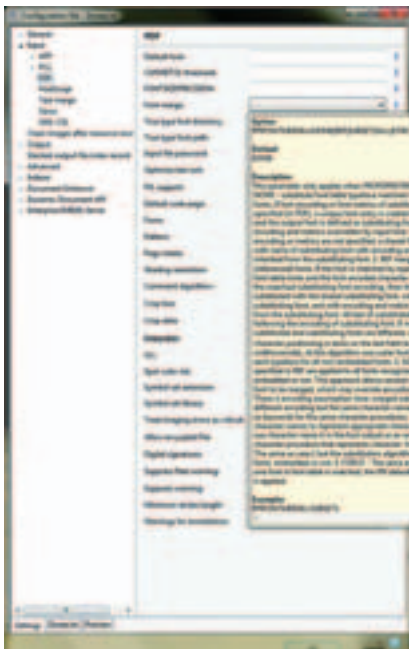
Online documentation help