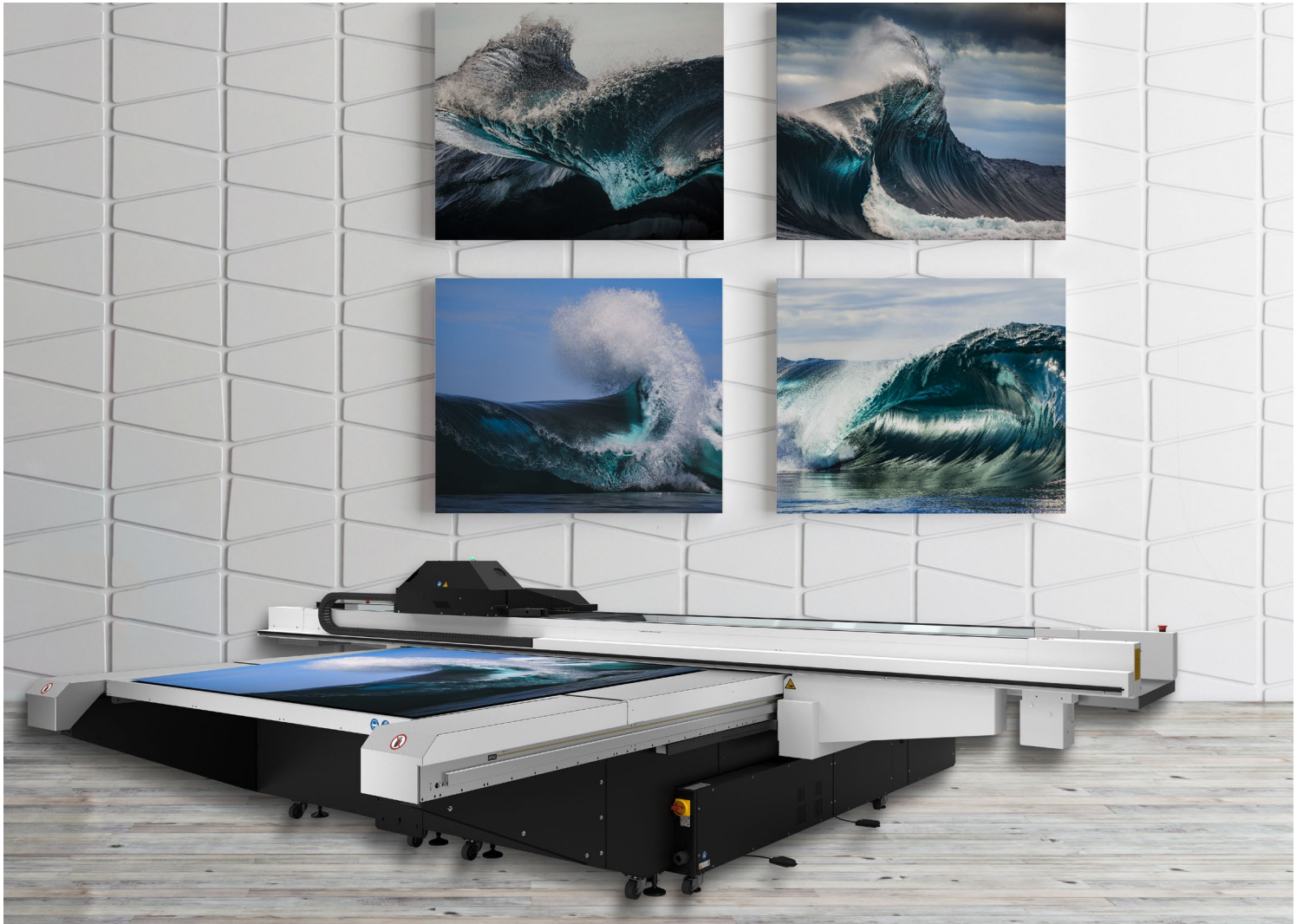
SPEC SHEET - ARIZONA 6100 MARK II SERIES UPGRADE