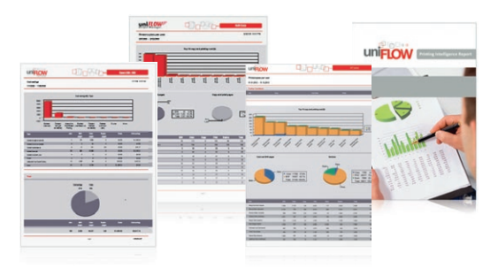
Measure and create detailed reports for all scans, copies, prints, and sent files.

Law firms can also limit user access to more efficient MFPs. For example, they can set controls so that print jobs over a specific page count, such as 50 pages, can be automatically rerouted to a less expensive printer or CRD.