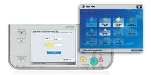
The Canon Access Management System (AMS) easily enables and restricts user access to key functionality based on authentication and user credentials.

Canon's Access Management System allows law firms to configure user roles, depending on predetermined user rights. An attorney may have access to specific device functions, such as copy or fax, and paralegals may have access only to stored forms on the device.